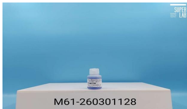
Figure 1: Test article.