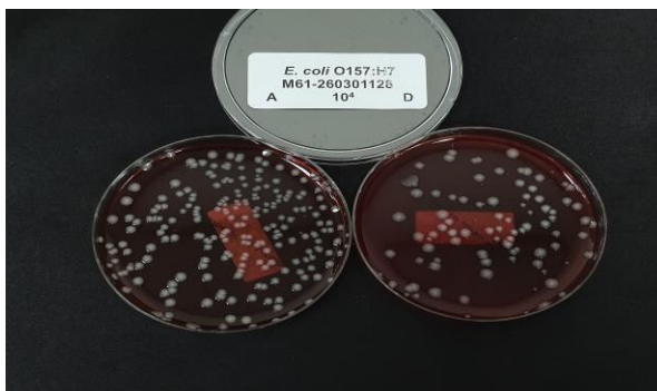
Figure 2: Result of control and test group.